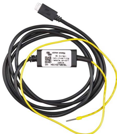
VE.Direct non inverting remote on-off cable

Switch off level: input voltage must be less than 1 V or must be free floating