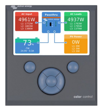
Color Control GX, showing a PV application

When connected to the Ethernet, systems with a Color Control GX or other GX device can be accessed and settings can be changed remotely.