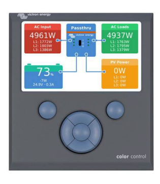
Color Control GX, showing a PV application

When connected to the Ethernet, systems with a Color Control GX or other GX device can be accessed and settings can be changed remotely.