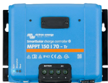
SmartSolar Charge Controller MPPT 150/70-Tr without optional display