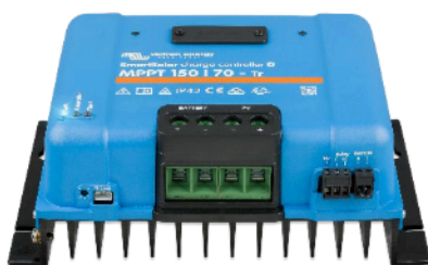
SmartSolar Charge Controller MPPT 150/70-Tr with optional display