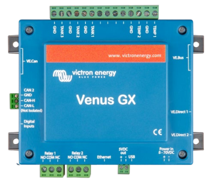
Venus GX with connectors