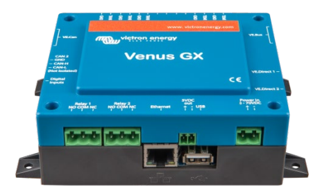
Venus GX front angle